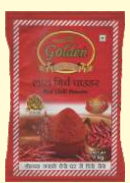
100gm / 200gm