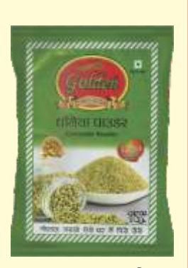
500gm / 1 kg