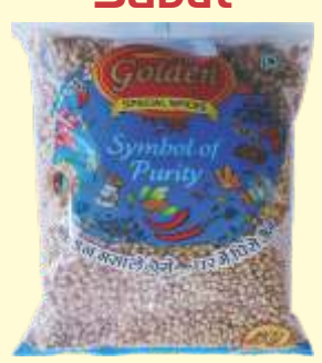
as per requirment