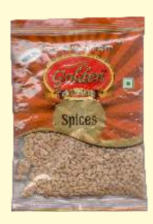
Kali Mirch Sabut